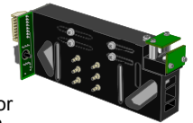
Stationary sensor Example: FI-23